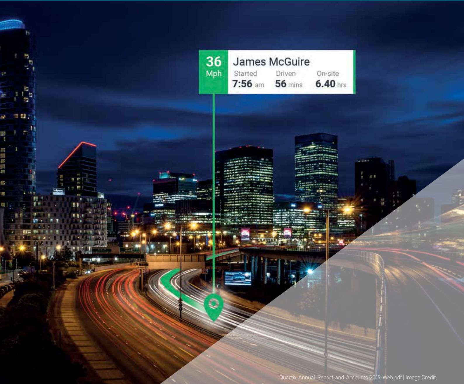
Quartix-Annual-Report-and-Accounts-2019-Web.pdf | Image Credit

Quartix was established in 2001 and is a leading supplier of subscription-based vehicle tracking systems, software and services in the UK.