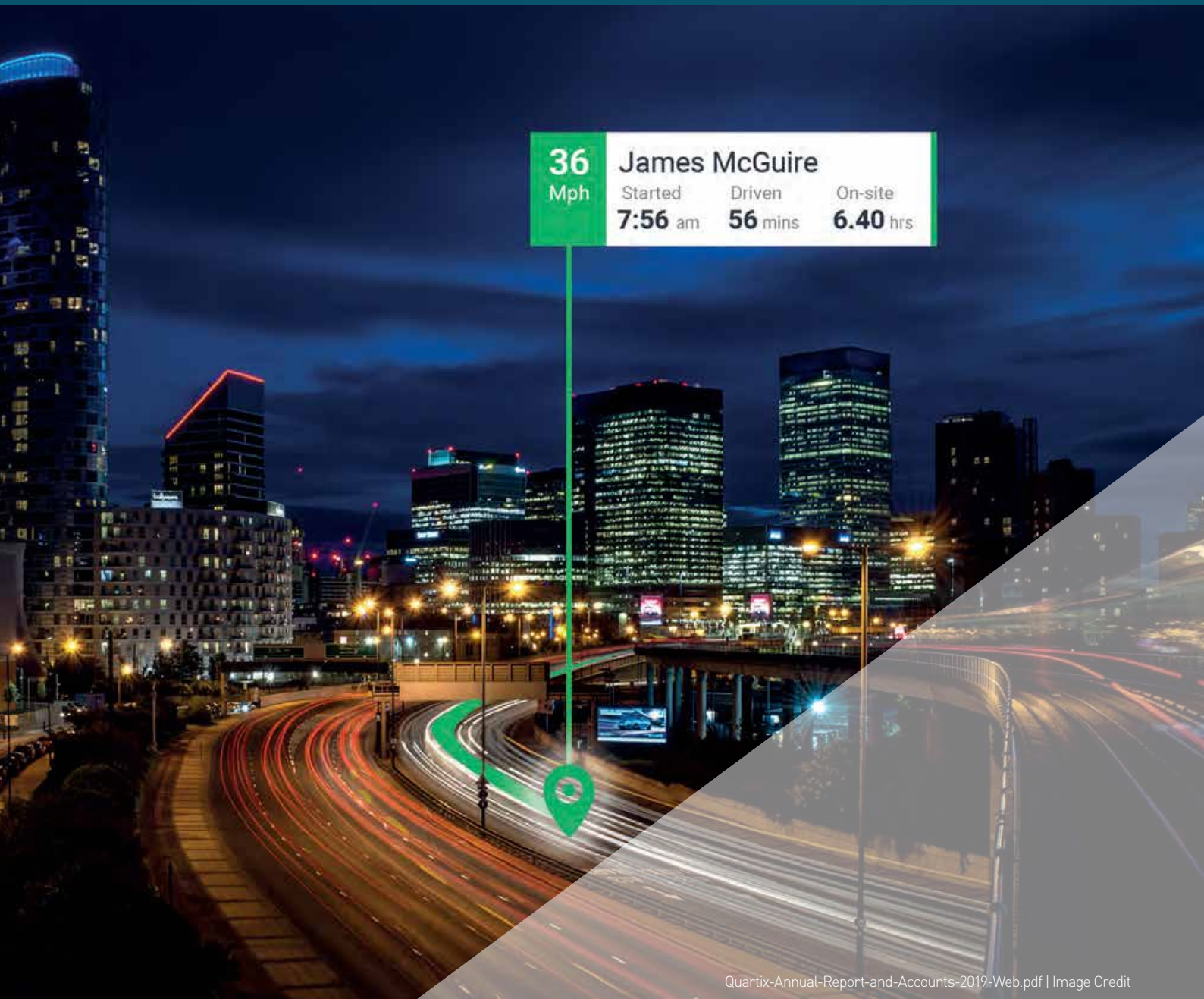
Quartix-Annual-Report-and-Accounts-2019-Web.pdf | Image Credit

Quartix was established in 2001 and is a leading supplier of subscription-based vehicle tracking systems, software and services in the UK.