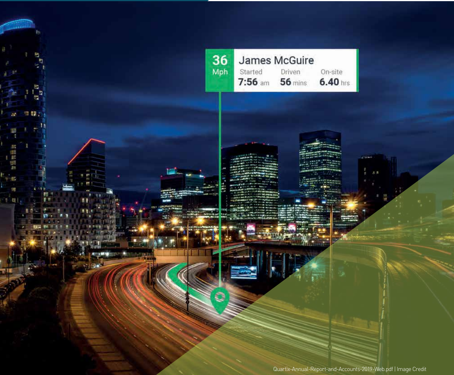
Quartix-Annual-Report-and-Accounts-2019-Web.pdf | Image Credit

Quartix was established in 2001 and is a leading supplier of subscription-based vehicle tracking systems, software and services in the UK.